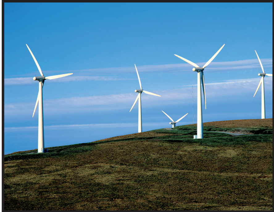
Unlike conventional generation, the power produced by solar and especially by wind can vary over a wide range in an unpredictable fashion, upsetting the entire balance of power supplied to the grid.

Initially, the problem of variable generation from solar and wind was easily accommodated as these sources made up a very small percentage of power supplied to the grid. But as more and more solar and wind plants are built and connected to the grid, variable generation is becoming a huge issue, particularly with wind power.